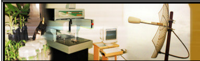
Information & Communication Technology